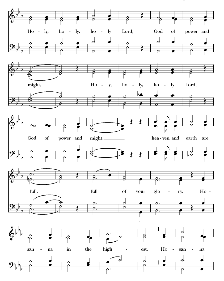
"HOLY, HOLY HOLY" Schubert Sanctus, #S-130, The Hymnal 1982

Therefore, with all whom you have made, cherished and called, with all who hunger for your kingdom and will not rest until all your children are fed, with the broken saints and redeemed sinners of all the ages, we take up the song of hour praise: